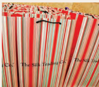
Silk Trading Company Bags Examples of Garden Party Gift Bag Sponsorship Branding Opportunity

GLEH offers a variety of promotional and sponsorship opportunities to allow your business and organization visibility on a variety of levels, while showing your support for those served by GLEH. Enclosed you will find the Sponsorship Benefits Chart that will help you determine the most appropriate sponsorship level for your business, organization or as an individual, couple or family. The publicity generated by last year's Garden Party was record setting and sets the stage for an even greater event this year. Reserve your sponsorship level today to ensure the maximum exposure, visibility, marketing opportunity and promotion of your business, organization or as a generous charitable family or individual effort.