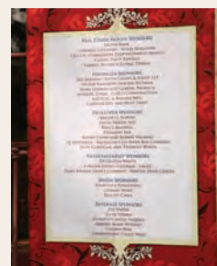
Sponsor Banners Day of Event Banners list Sponsors throughout event

Please feel free to contact us with questions, as we are happy to work with you and your budget to customize a sponsorship package that meets your promotional needs while supporting our ongoing fundraising efforts.