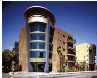
Triangle Square - Hollywood ®

Gay & Lesbian Elder Housing is a non-profit organization whose mission is to improve the life experience of Lesbian, Gay, Bisexual & Transgender (LGBT) seniors by developing affordable housing, providing comprehensive care and ensuring through advocacy and education, a brighter future for the LGBT elder community. Open in 2007, GLEH has 104 affordable housing units and serves low and extremely low-income seniors over the age of 62. Our on-site social services, programs and activities provide immediate access to support, as well as various programs, social activities and nutritional support programs including an on-site food pantry to supplement the basic food needs of our elders.