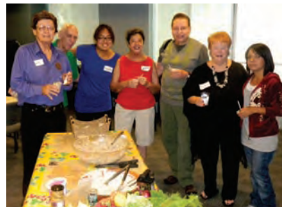
GLEH Residents participate in Senior Nutritional Programs with Hollywood Farmers Market Staff

Programs such as an on-site food pantry, physical health and recreation classes, nutritional programs, care management and a buddy program are part of the unique services provided by GLEH.